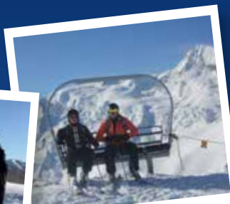
Some of the team had fun on and off piste in Sainte Foy