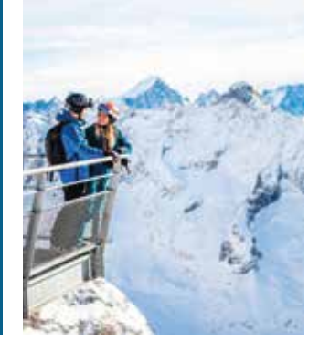
See all our properties and resorts online peakretreats.co.uk