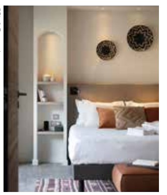
Experience the real French Alps with the award-winning French Alps ski specialist